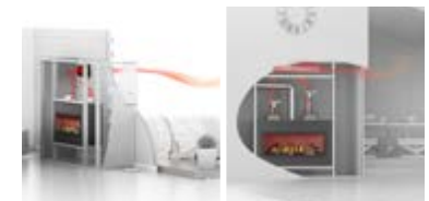
Included heat management (DHC) for superior design flexibility (DHCP & DHM optional)