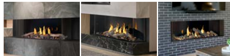
Three-sided, corner, one-sided installation options