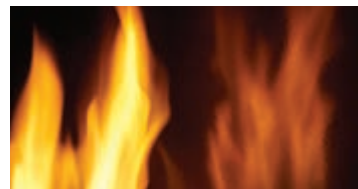
MIRRO-FLAME™ Porcelain Reflective Radiant panels included