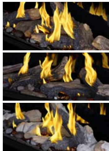
Choice of oak, driftwood or birch luminous logs