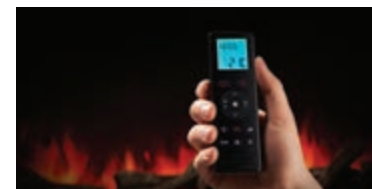
Included premium remote, Napoleon Home mobile app or optional wall mount control