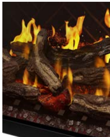
Glowing Split Oak Log Set and Woodland Kit included