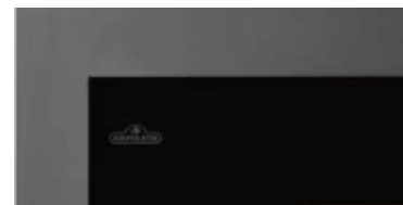
Included finishing flange and 1 piece trim