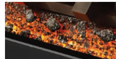
Modulating ember bed with 5 natural colors and 13 top light colors