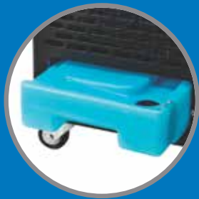
Easy empty bucket