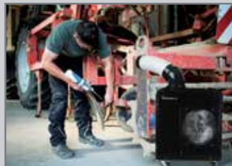
Farms and Sheds