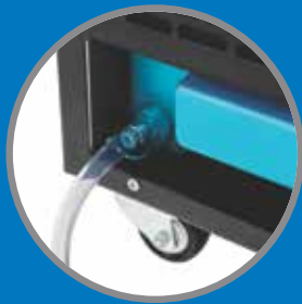
Continuous drainage with 6' hose included