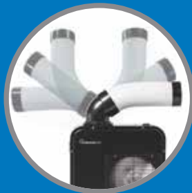
Hose Extends and Bends