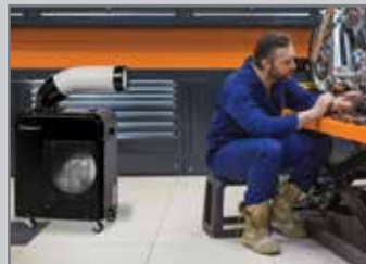
Garages and Workshops