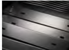
Dual-Level Stainless Steel Sear Plates