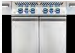
PROXIMITY LIGHTING Projects Napoleon Logo