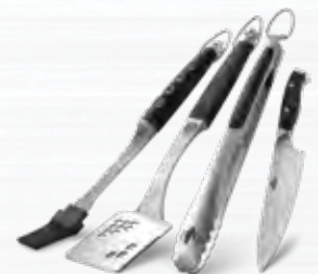
EXECUTIVE FOUR PIECE STAINLESS STEEL TOOLSET #70037