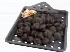
CAST IRON CHARCOAL / SMOKER TRAY #67732