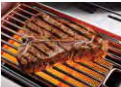
Infrared SIZZLE ZONE™ Side Burner