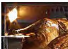
Interior Lights for Late Night Entertaining