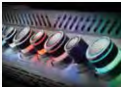
LED SPECTRUM NIGHT LIGHT™ Control Knobs with SafetyGlow™