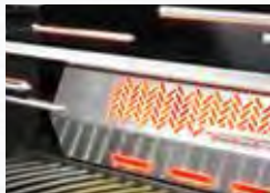
Rear Infrared Rotisserie Burner