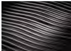
9.5 mm Stainless Steel Iconic WAVE™ Cooking Grids