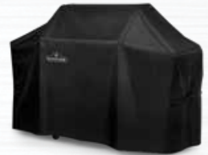
PREMIUM FITTED COVER #61500