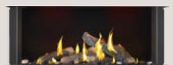
Tall Bay Luxuria™