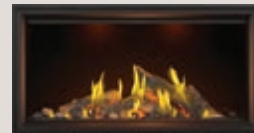
Tall Vector™ with Luminous Logs