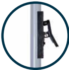
Quick Clip™ for Easy Setup