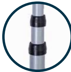
Twist Lock Design