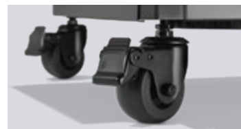
Caster wheels with 2 point leveling system