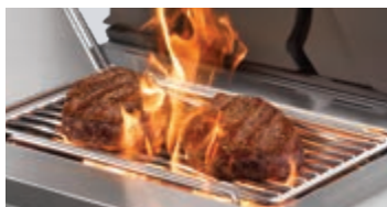
Infrared SIZZLE ZONE® side burner