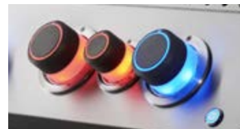
SafetyGlow™ control knobs