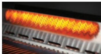
Infrared rear rotisserie burner with included heavy duty rotisserie kit