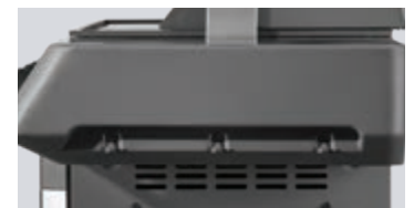
Integrated, hidden tool hooks