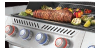
Guided LED lighting