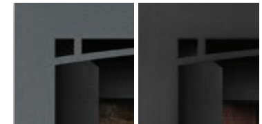
Optional zen front – charcoal, black