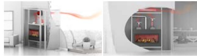
Optional heat management (DHC & DHM) means no need for additional blowers or power vent systems and allows for TV installs above and recessed into the wall for superior design flexibility