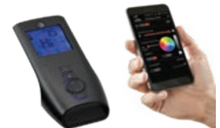
Remote control included and eFIRE Remote App - total control of your fireplace from your mobile device