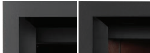
Optional finishing trims – charcoal and black