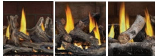
Three ultra-HD premium log set options – driftwood, oak, and birch