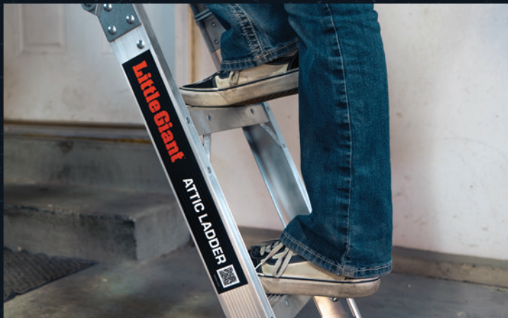
WIDE, NON-SLIP TREADS