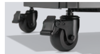
Caster wheels with 2 point leveling system