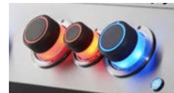
SafetyGlow™ control knobs