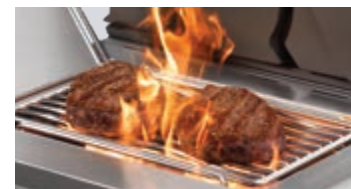
Infrared SIZZLE ZONE® side burner