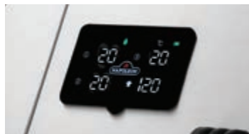
Wi-Fi and Bluetooth® connectivity, LCD display