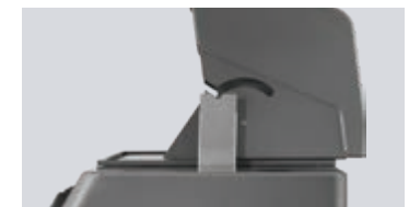
LIFT EASE™ roll-top convection lid