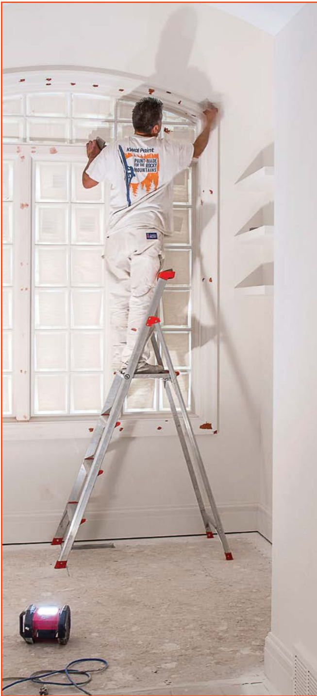
EXTRA WIDE, HEAVY DUTY, STANDING PLATFORM