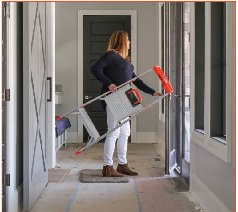
LIGHT WEIGHT AND EASY TO STORE AND CARRY