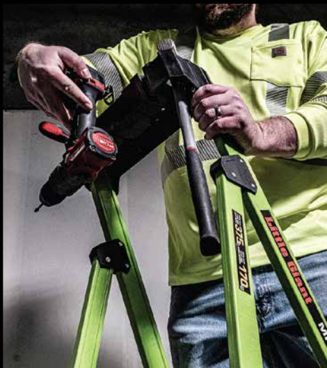
Innovative Top Cap and Tool Tray