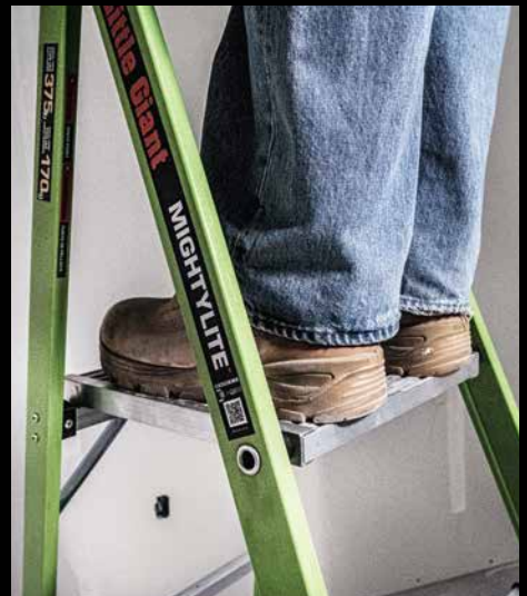
Comfortable Standing Platform