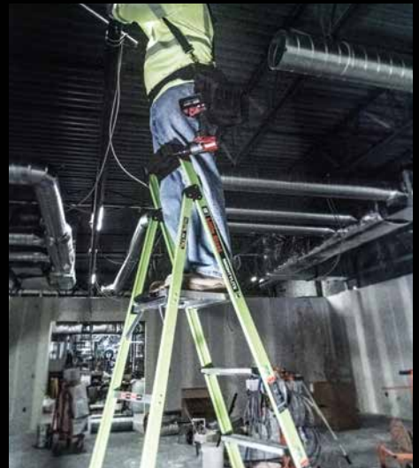
Feels Like Standing On The Ground