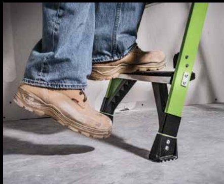
Ground Cue® Available On IAA models