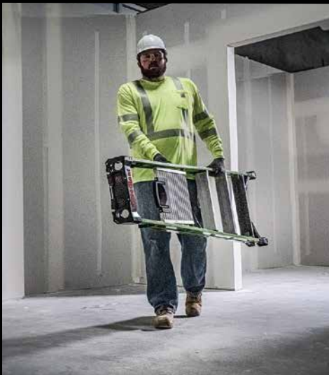
Lightweight, Non-conductive Fiberglass