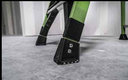
Extra-Wide Non-Slip Feet