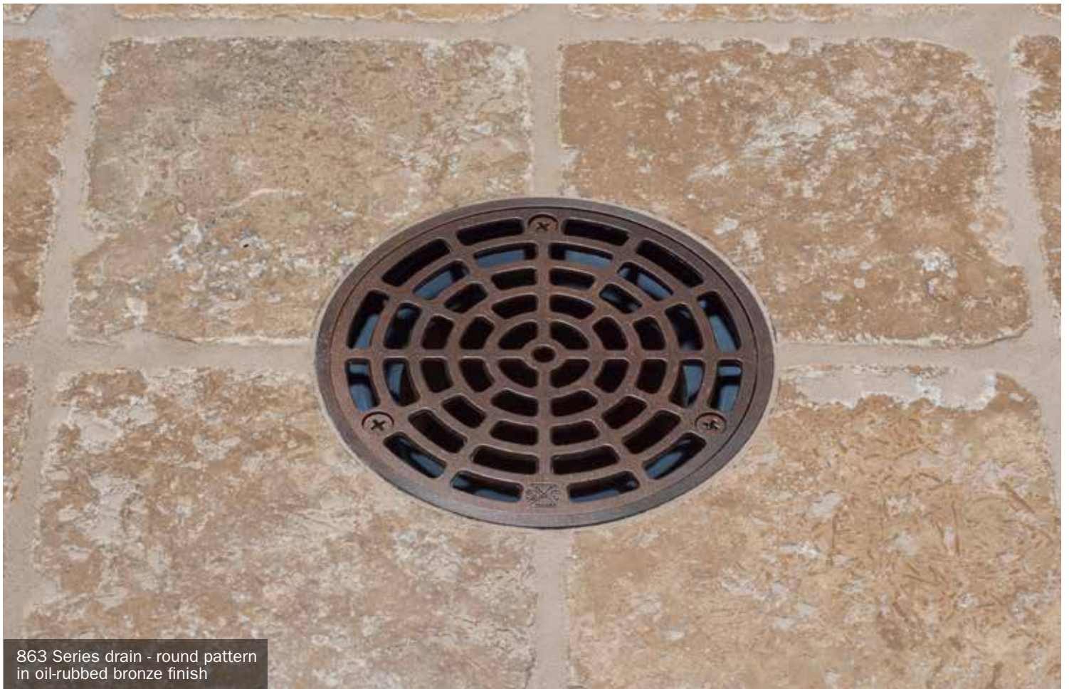
863 Series drain - round pattern in oil-rubbed bronze finish