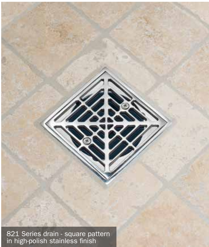
821 Series drain - square pattern in high-polish stainless finish