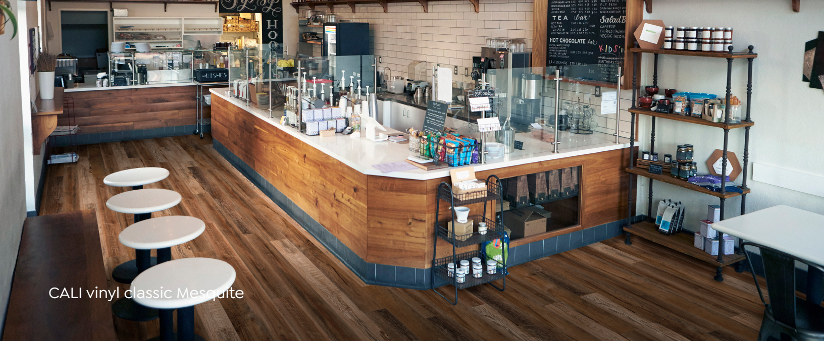
CALI vinyl classic Mesquite