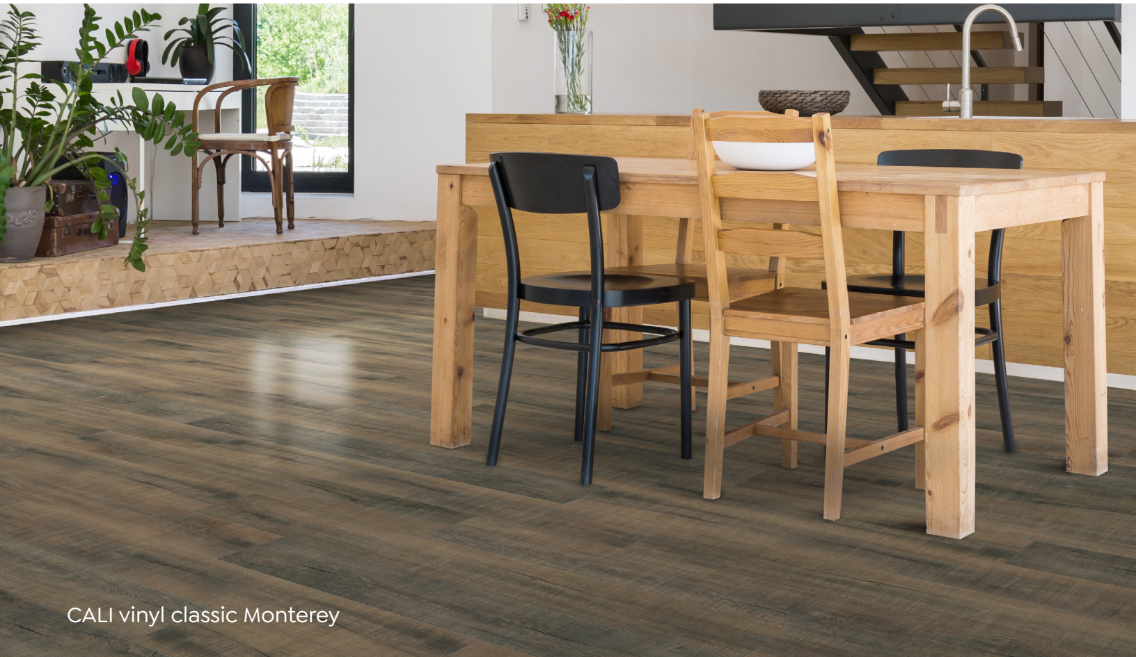
CALI vinyl classic Monterey