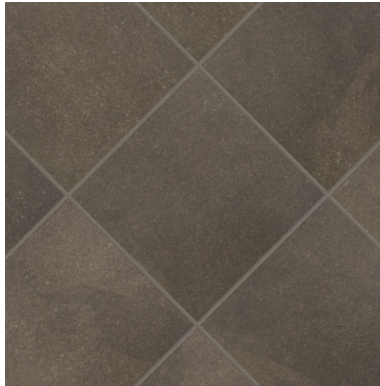
AV213 ▶ Bistro Brown