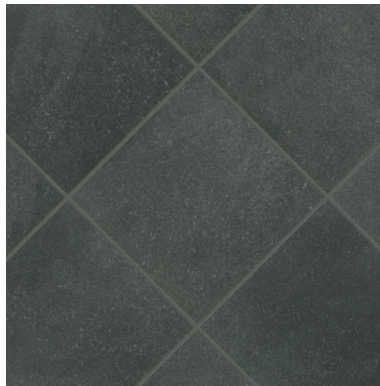
AV215 ▶ Boutique Black