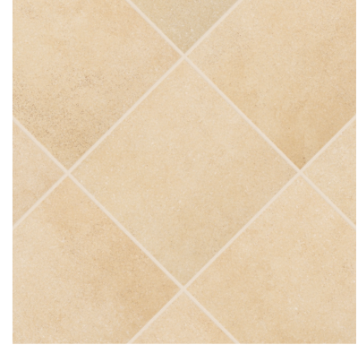
AV212 ▶ Café Caramel