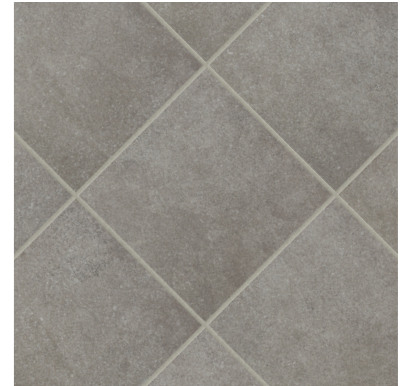
AV214 ▶ Gallery Grey