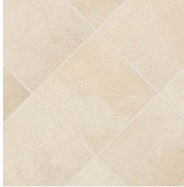
AV211 ▶ Cinema Champagne