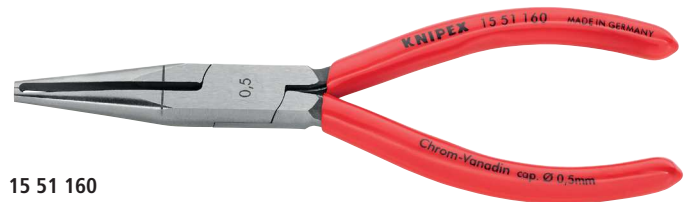
15 51 160 MM