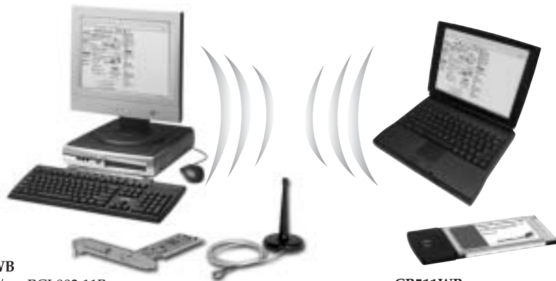
PCI511WB 11 Mbits/sec PCI 802.11B Wireless Adapter Card

To install an Ad Hoc network, you need two computers and two wireless adapters. Follow the instructions below to set up an Ad Hoc network between your two adapters, using the product Quick Install or Instruction Guides for details when necessary.