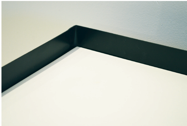
Factory installed Tile Flange is bonded to the the sides of the tub as specified at the time of order.

The Tile Flange option ensures watertight installation between the tub deck and the surrounding wall area. Specify factory-installed flange at the time of order, or as a field-installation kit to be applied onsite.