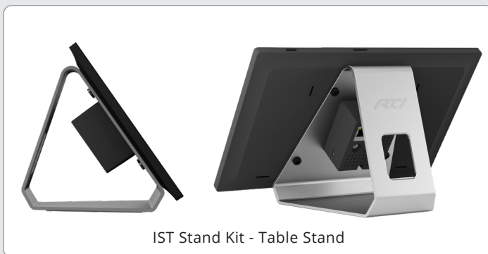
IST Stand Kit - Table Stand