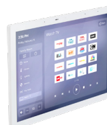
IST-10-W (White Bezel)