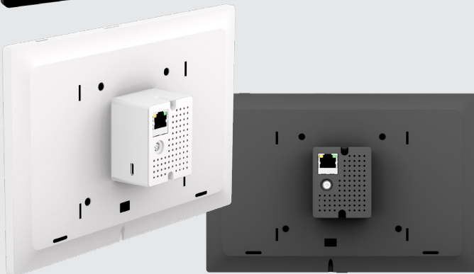
Accessory (sold separately)