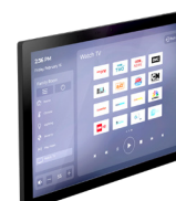
IST-10-B (Black Bezel)