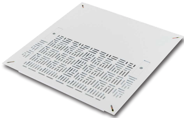
Hybrid Chamfer Panel Crystal White