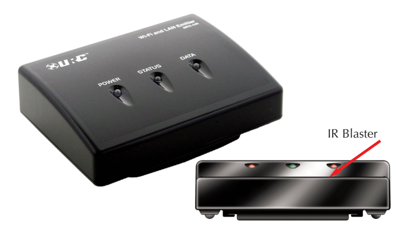
Power LED : The Power LED illuminates when the unit is powered.

The front panel consists of 3 indicator lights and an IR Blaster.