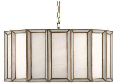
Shown in antique brass / opal

The Daze Pendant is made of articulated panels of White Milk Glass that are joined together by ribs of Metal in an Antique Brass finish. This Daze will turn luminous when it is switched on.