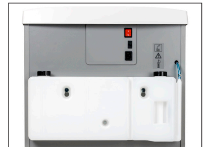
The 1 gallon EvenFlow Lubricator provides continuous lubrication for peak performance.