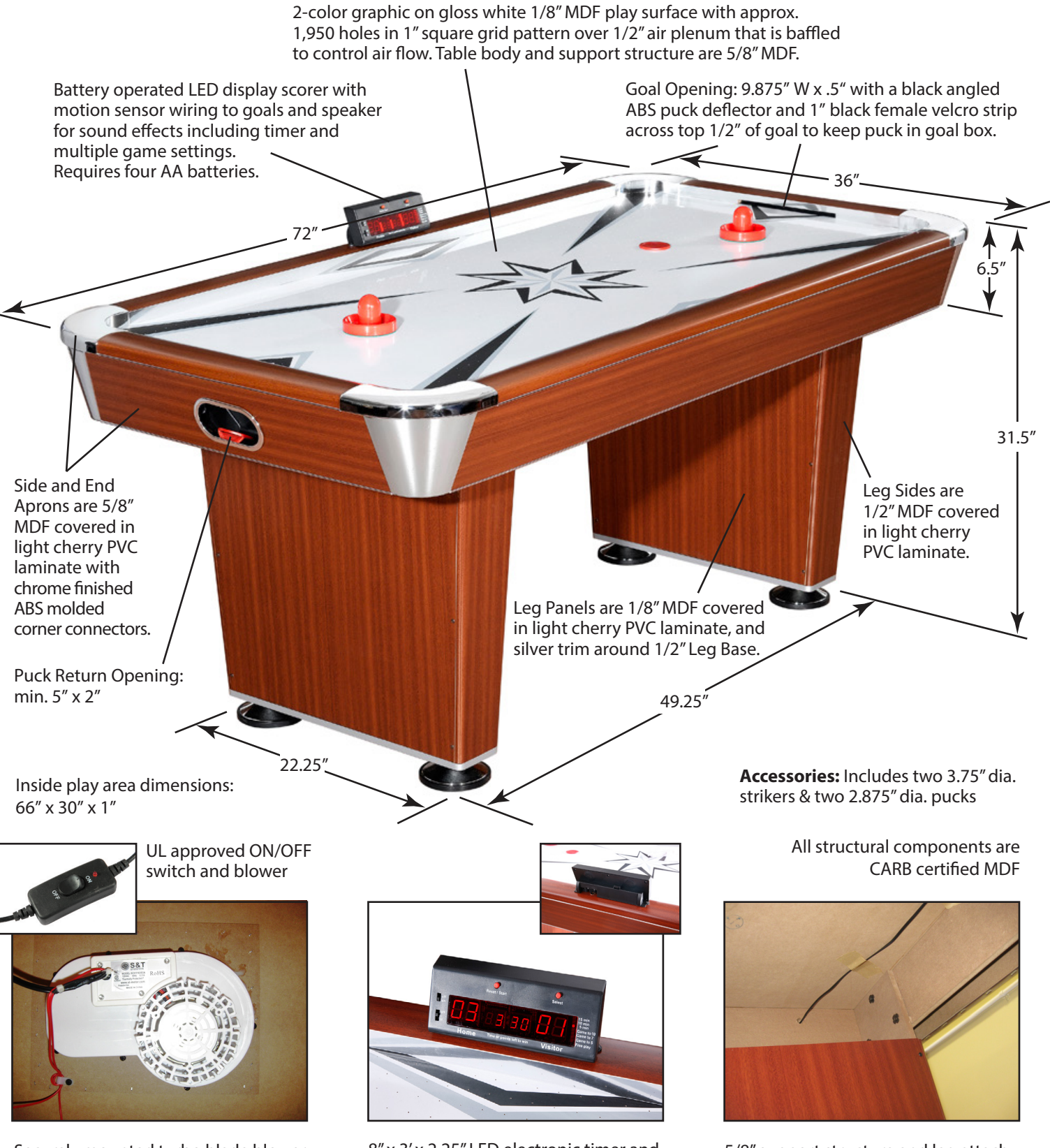
Securely mounted turbo blade blower, AC120V 60 Hz 0.31A, with a min. 9" x 12" mounting board.