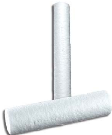
Figure 1 : Hytrex Depth Cartridge Filters