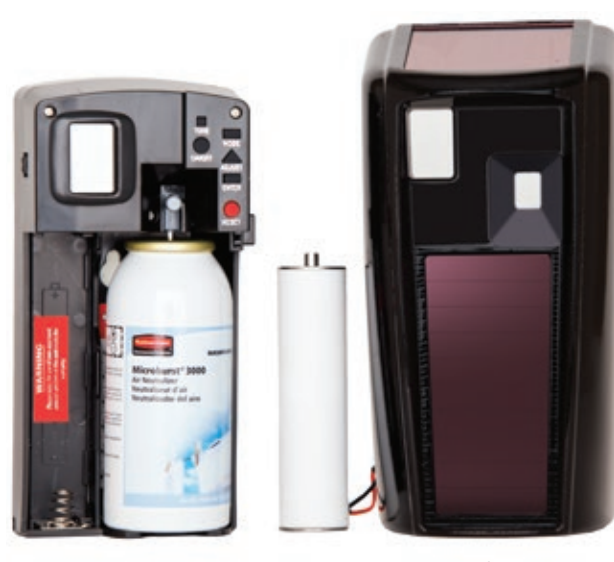
Existing Dispenser Back Plate

LumeCel's rechargeable energy cell and solar panels help to create a positive environmental impact by being 100% recyclable, which greatly reduces landfill fees and toxic alkaline battery disposal fees.