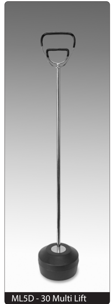
ML5D - 30 Multi Lift

The Magnet Source® brand is a trademark of Master Magnetics, Inc. and represents exceptional quality, expertise and customer service.