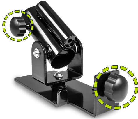
T-BAR ROW WITH 2 TIGHTENING KNOBS