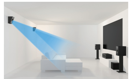
5.1 setup with 2 x Q50a

A 5.1 home theatre system setup is shown here with wall-mounted Q50a Surround Speaker modules.