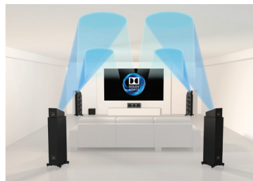
5.1.4 setup with 4 x Q50a