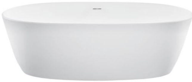
Elena 3 features an integrated slotted overflow.