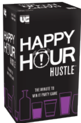
Happy Hour Hustle™ Ages 21+