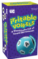
Irritable Vowels™ Ages 8+

©2023 University Games Corporation, San Francisco, CA 94110. Rom Com is a trademark of University Games Corporation. All Rights Reserved. U. Games Australia, Level 1, 10 Willoughby Rd, Crows Nest NSW, Australia 2065. University Games UK, 4 The Lanterns, 16 Melbourn Street, Royston, Hertfordshire, SG8 7BX. U Games Ireland Logistics Ltd, 15 Main Street, Raheny, Dublin 5. Retain this information for future reference. MADE IN CHINA. B013502 09/23