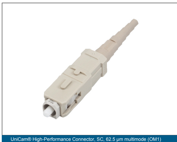
UniCam® High-Performance Connector, SC, 62.5 μm multimode (OM1)