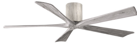
Shown in barn wood / barn wood tone

The Atlas Irene Hugger Ceiling Fan is rustic yet strikingly modern, with cleanly joined solid wood blades and a minimal cylindrical motor housing. Its streamlined profile with the warm, natural look of wood works beautifully in contemporary and transitional spaces. Equipped with a DC motor, the fan is energy efficient and ultra-quiet. A hand-held remote control and wall control are included, both able to turn the motor on/off and set 6 speeds and forward/reverse. For fans that have a light, the controls also turn the light on/off and dims it. Fans that have a light include a cap matching the housing finish for no-light use. Note: Some combinations of motor finish, blade color, and light option are not available. The 72 inch is available in a 3-blade only and is not available with a light option.