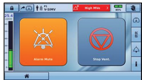
Big button for greater accessibility

Big button: Included for quick access to start or stop ventilation, as well as to mute alarms, this feature is particularly useful for those with impaired dexterity or eyesight.