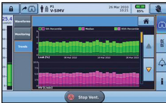
Monitoring options with at-a-glance visuals

ResScan™: ResMed's patient data management software provides clinicians with a great way to view statistical, summary, detailed and alarm data.