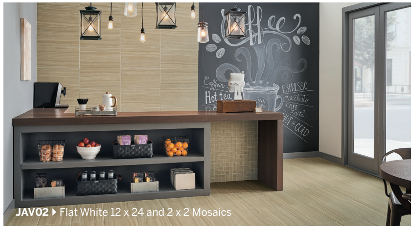
JAV02 ▶ Flat White 12 x 24 and 2 x 2 Mosaics