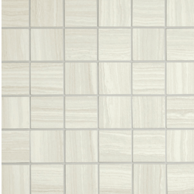
JAV01 ▶ Two Sugars 2 x 2 Mosaics