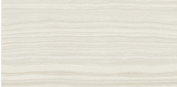
JAV01 ▶ Two Sugars