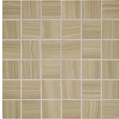
JAV02 ▶ Flat White 2 x 2 Mosaics