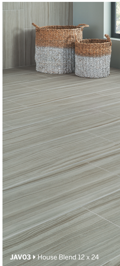
JAV03 ▶ House Blend 12 x 24

Information listed here is subject to change. Please refer to CrossvilleInc.com for the latest, most accurate information.