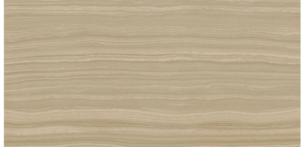
JAV02 ▶ Flat White