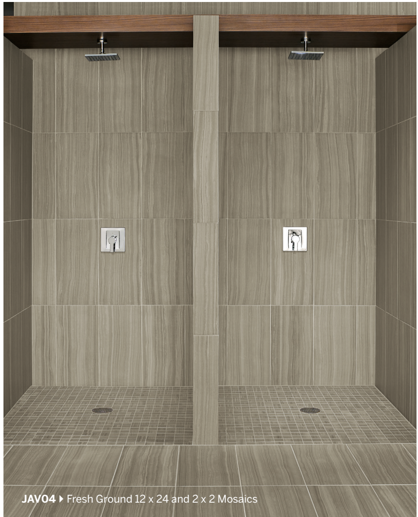
JAV04 ▶ Fresh Ground 12 x 24 and 2 x 2 Mosaics