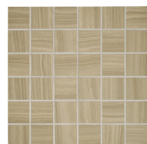
2 x 2 Mosaics UPS Finish (Mounted on an 12 x 12 sheet.)