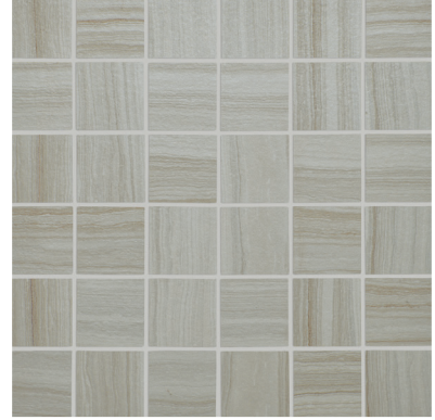
JAV03 ▶ House Blend 2 x 2 Mosaics