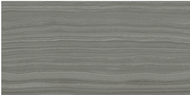
JAV05 ▶ French Press