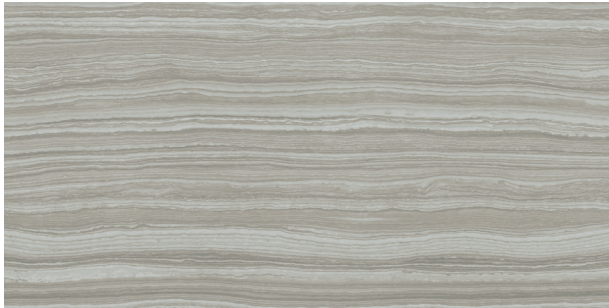
JAV03 ▶ House Blend