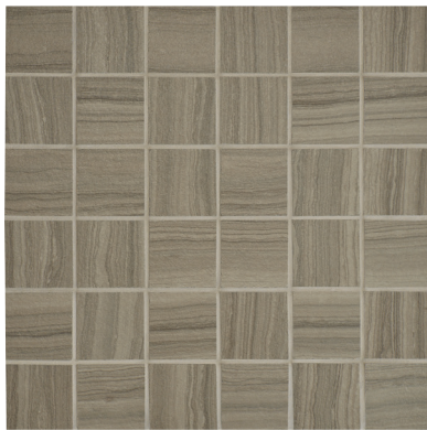
JAV04 ▶ Fresh Ground 2 x 2 Mosaics