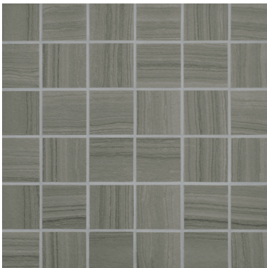
JAV05 ▶ French Press 2 x 2 Mosaics