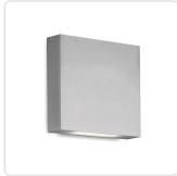
AT6606-BN-UNV Brushed Nickel