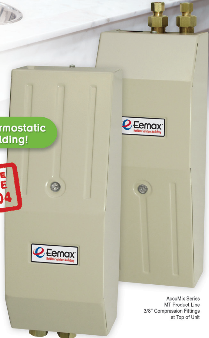
AccuMix Series MT Product Line 3/8" Compression Fittings at Top of Unit