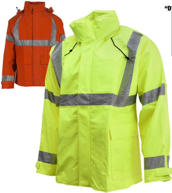
"D" RING ACCESS PORT

The NeeseArc FlexArc products are made from a unique polyurethane on a weft knitted FR treated cotton and designed give the wearer excellent range of motion and lightweight protection especially for utility workers exposed to electrical arc hazard.