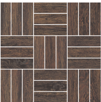
25555/M12REC Olive Parquet Mosaic