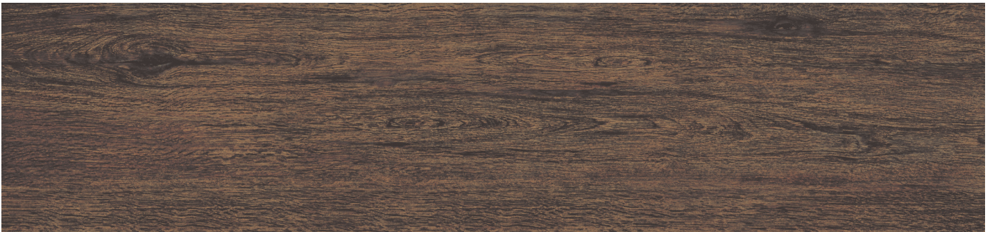
25555 8x36 Olive