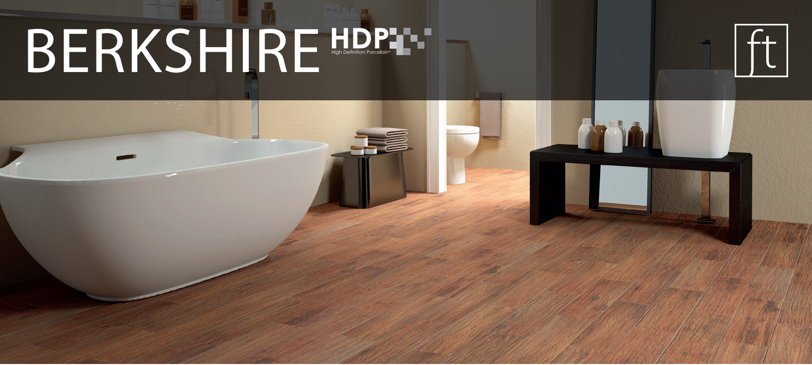
above: 25585 6x24 Walnut