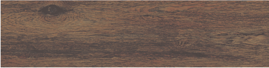
25555 6x24 Olive