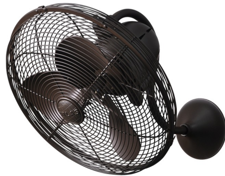
Shown in textured bronze

The Atlas Fan/Laura Wall Fan is compact and powerful. The whisper quiet 3 speed DC motor oscillates left to right 90 degrees, providing air to the whole room. Features a 15 inch blade span with a 31 degree pitch. Includes a 3 speed RF hand held remote control in Black. UL listed. Damp location rated for use in covered porches, patios and sunrooms. Limited lifetime motor warranty.