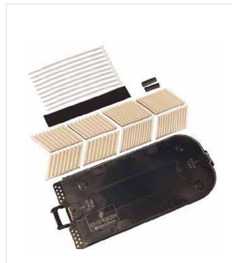
Universal Splice Tray