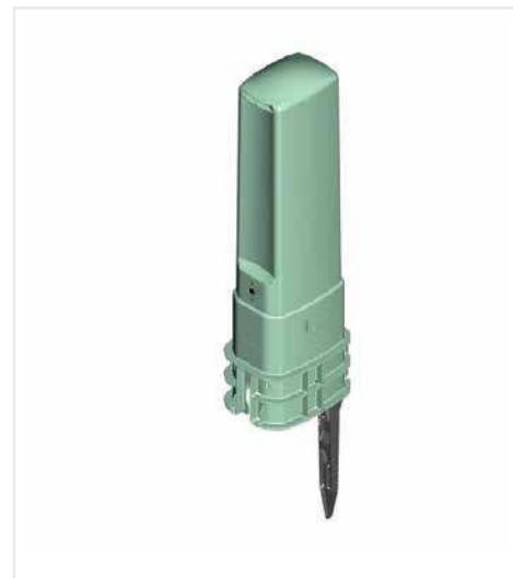
Short Self-Supporting Base Shown with Snap-On Stake