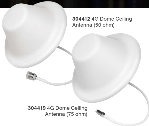
304412 4G Dome Ceiling Antenna (50 ohm)