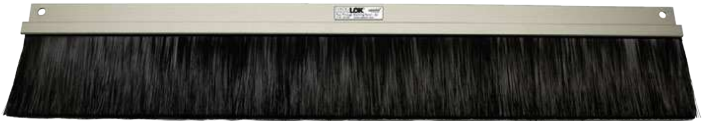
2U Pass Through Blanking Panel - Part No. 10113