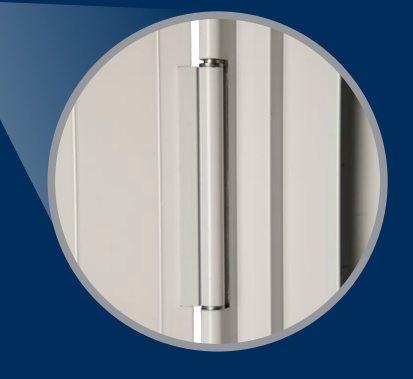
Four extruded hinges with bushings