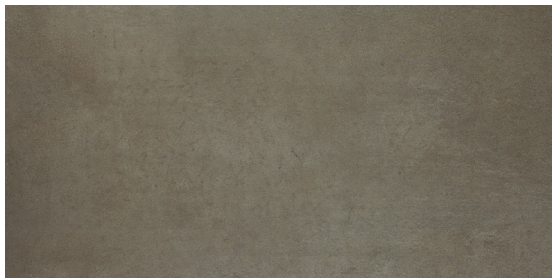
NTR05 ▶ Leading Man