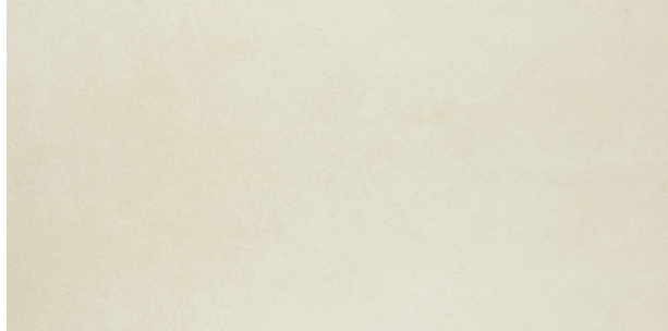
NTR01 ▶ Femme Fatal