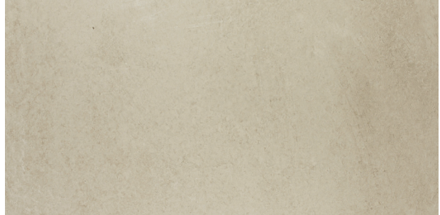
NTR02 ▶ Private Eye