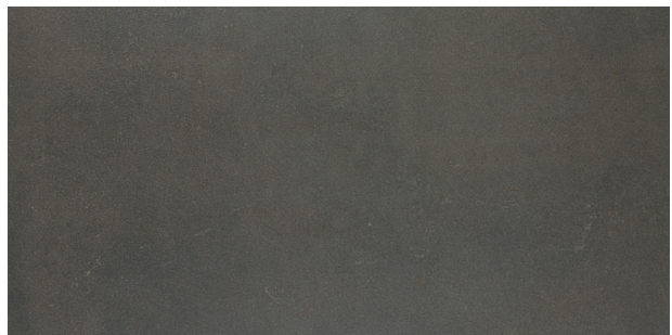
NTR06 ▶ Film Noir