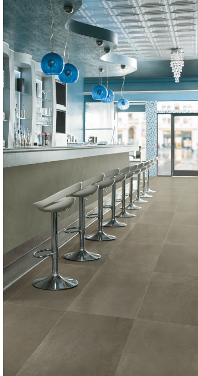
NTR05 ▶ Leading Man 24 x 36 UPS on floor Laminam by Crossville ▶ Calce Grigio on bar

Regular cleaning is the best way to keep Notorious tile looking good for years to come. Use clean, hot water (combined with a household cleaner for more aggressive cleaning). Rinse thoroughly and dry with a soft cloth. No waxes are needed. More Information regarding the care and maintenance of Crossville® products is available at CrossvilleInc.com .