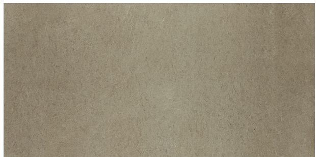
NTR04 ▶ Suspense