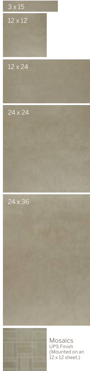
Mosaics UPS Finish (Mounted on an 12 x 12 sheet.)