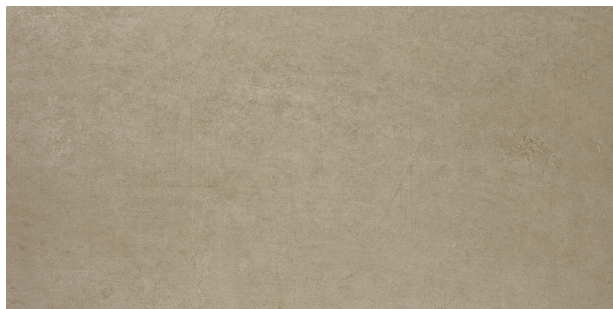
NTR03 ▶ Sugar Daddy