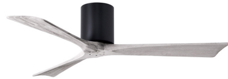
Shown in matte black / barn wood tone

The Atlas Irene Hugger Ceiling Fan is rustic yet strikingly modern, with cleanly joined solid wood blades and a minimal cylindrical motor housing. Its streamlined profile with the warm, natural look of wood works beautifully in contemporary and transitional spaces. Equipped with a DC motor, the fan is energy efficient and ultra-quiet. A hand-held remote control and wall control are included, both able to turn the motor on/off and set 6 speeds and forward/reverse. For fans that have a light, the controls also turn the light on/off and dims it. Fans that have a light include a cap matching the housing finish for no-light use. Note: Some combinations of motor finish, blade color, and light option are not available. The 72 inch is available in a 3-blade only and is not available with a light option.