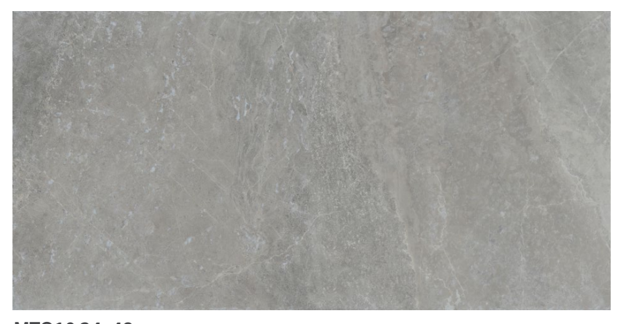
MTQ10 24x48 MTQ10 24x48R* Loft