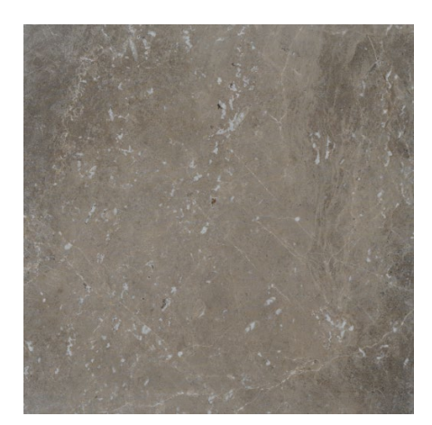
MTQ40 24x24 Estate