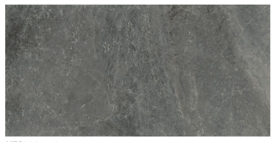
MTQ30 24x48 MTQ30 24x48R* Salon