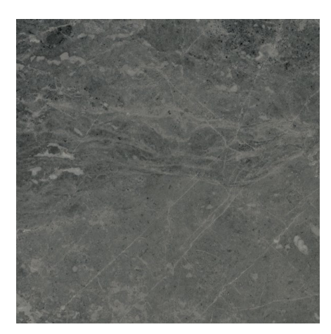
MTQ30 24x24 Salon