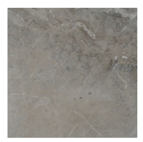
MTQ20 24x24 Chateau