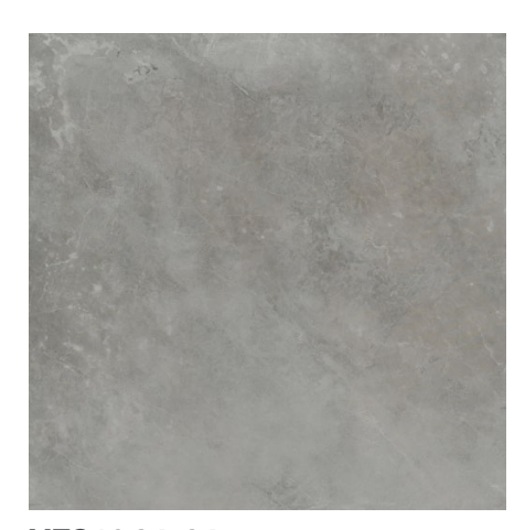
MTQ10 24x24 Loft