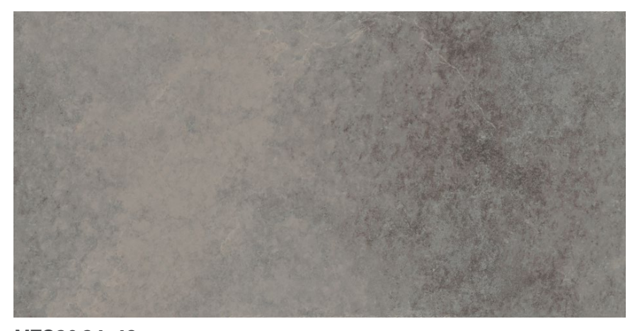
MTQ20 24x48 MTQ20 24x48R* Chateau