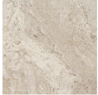
Trail VTL JOTR