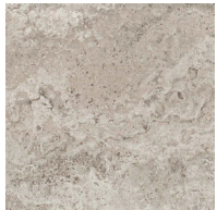
Course VTL JOCO