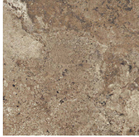
Path VTL JOPA