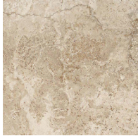
Road VTL JORO