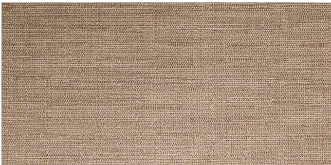
TAUPE FABRIC IF52