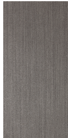
GRAY WENGE IF65