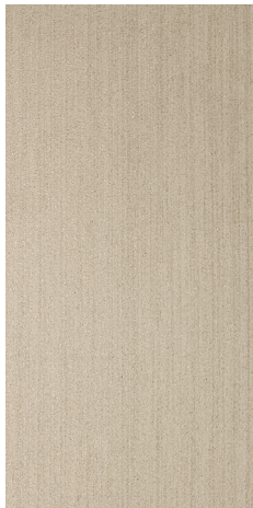
BEIGE WENGE IF61