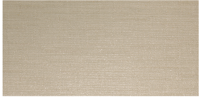
BEIGE FABRIC IF51