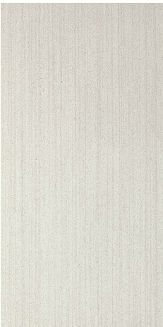
WHITE WENGE IF60