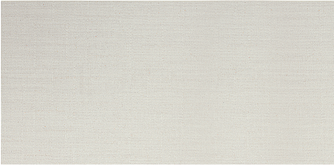
WHITE FABRIC IF50