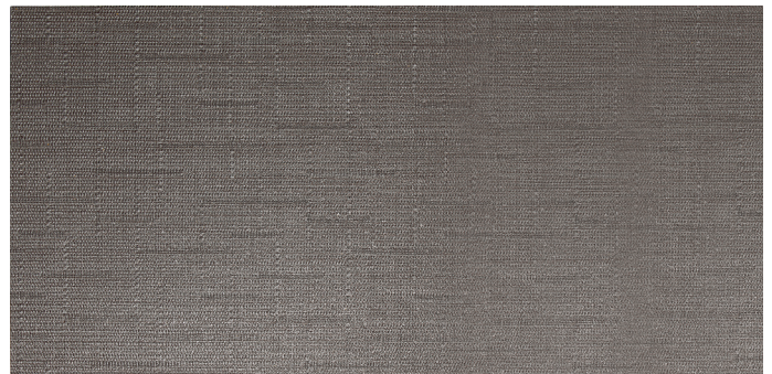
GRAY FABRIC IF55