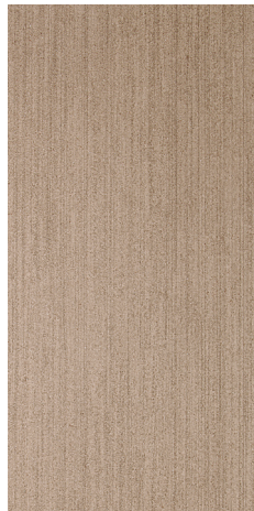
TAUPE WENGE IF62